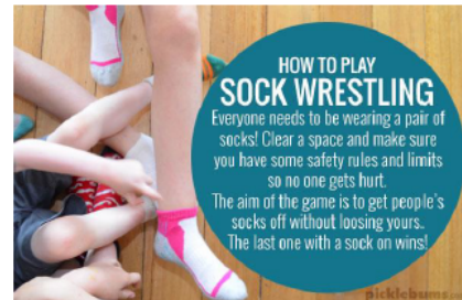
Image source: https://picklebums.com/20-fun-ways-to-get-active-with-your-kids/